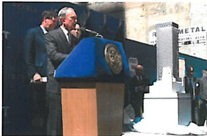
New York City Mayor Michael R. Bloomberg addresses attendees at the launch of the International Gem Tower in New York's Diamond District.

New York--New York City Mayor Michael R. Bloomberg was among the dignitaries on hand Tuesday in New York's Diamond District for the official launch of the 34-story International Gem Tower.